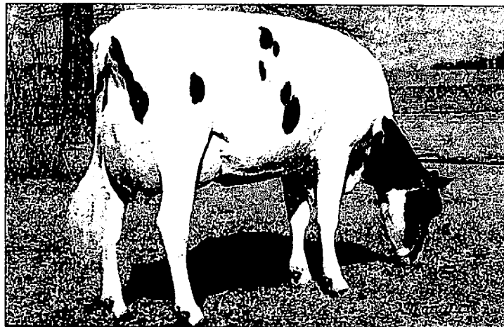
LEFT: A Toystory daughter. AI Services is expecting a new delivery of semen from this tremendously exciting sire next week.

"There is widespread satisfaction with his milking daughters in Northern Ireland. They are average in stature, with good body capacity, excellent foot angle, and snugly attached udders."