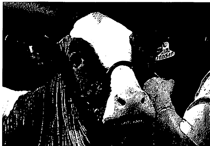
Fluttering her eyes for a few more bids, this young red heifer looks on.