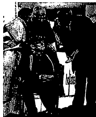
Decisions, decisions... salegoers study the catalogue to pick out some of the best buys of the day.