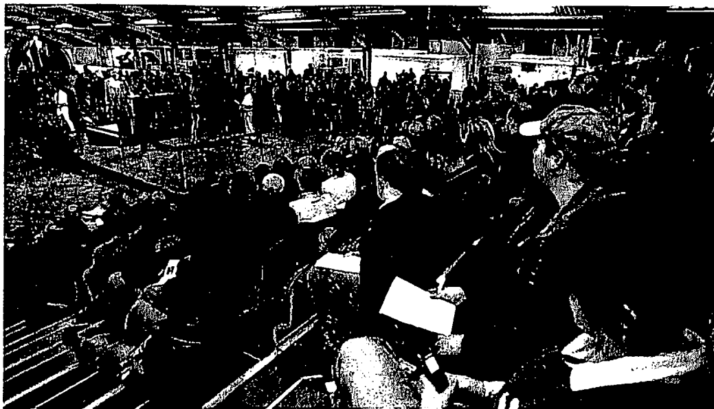
All eyes focus on this young heifer as the bidding begins.