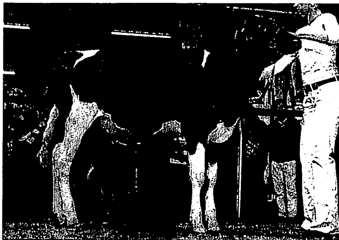
A flurry of bids secured this top-price animal Sahara Talent Licorice at 14,000gns for Pedran Holsteins, Pembrokeshire.